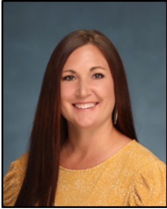
Counselor 6th Grade