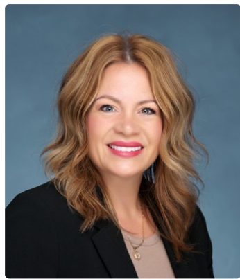
Assistant Principal 6th Grade