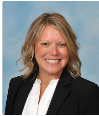
Assistant Principal 8th Grade