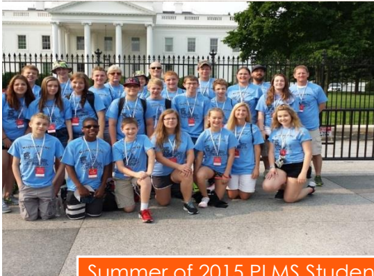
Summer of 2015 PLMS Students and Chaperones

There will be a parent informational meeting for the trip on Thursday, October 6th at 6:30 p.m. in the PLMS Library Media Center.