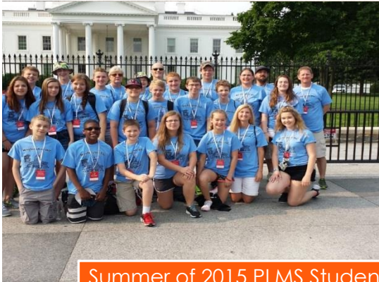
Summer of 2015 PLMS Students and Chaperones

There will be a parent informational meeting for the trip on Thursday, October 6th at 6:30 p.m. in the PLMS Library Media Center.